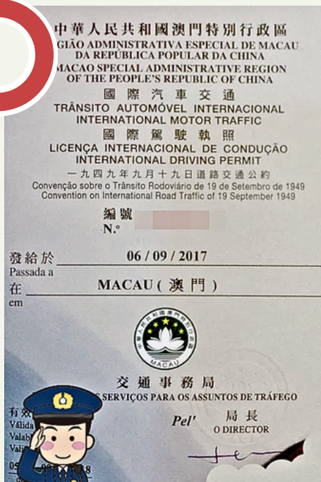
Geneva Convention license (issued in Hong Kong and Macau)