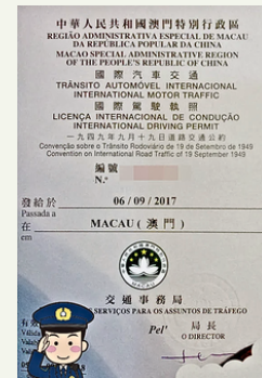
International Driving Permit

※ Indonesia, Myanmar, Brazil, and Vietnam are non-signatory countries.